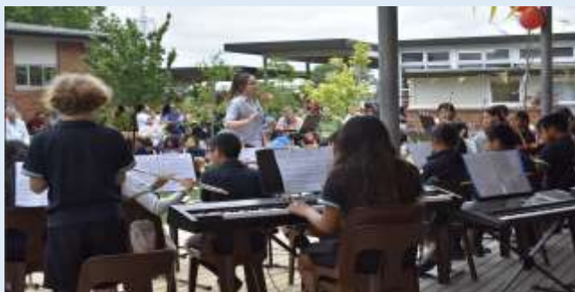
Festival of the Arts Orchestra Performance

REMINDER SCHOOL FINISHES TUESDAY 15 TH DECEMBER AT 2PM