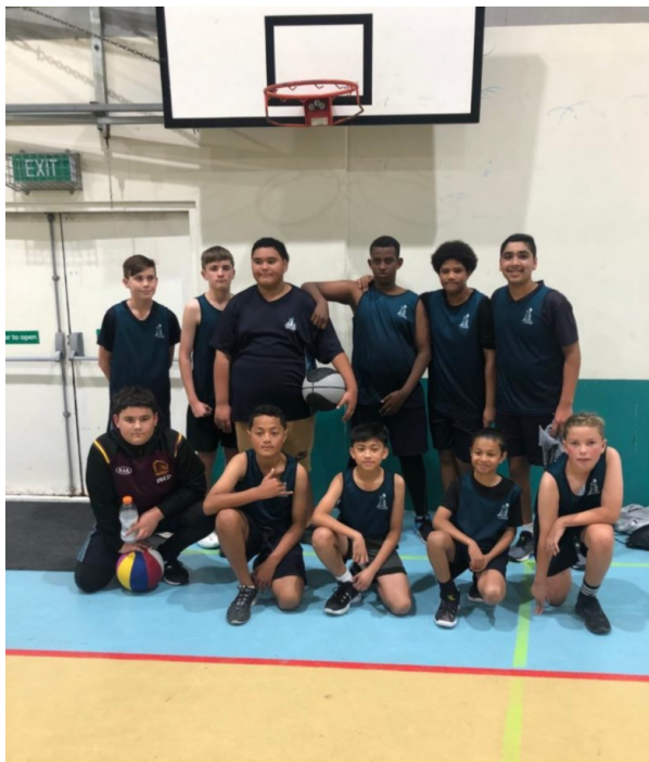
Boys Basketball League 2021

If you are in the area on a Tuesday evening, pop in to support our boys. Click on this link to take you to the season's draw.