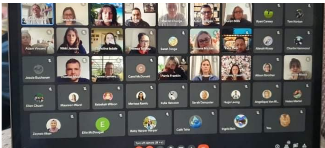
Whole staff meeting during lockdown 2.0