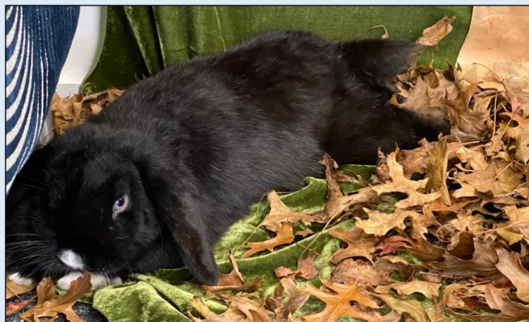
Spud the Library rabbit is a very relaxed member of staff

Manaakitanga Whanaungatanga Wairuatanga Rangatiratanga Respect Relationships Well-being Leadership