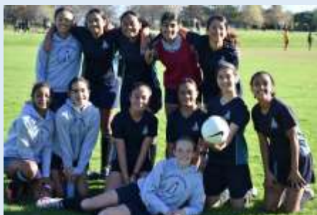
Year 8 Poikiri

Well done to all of our amazing year 7 players as you know we won 3 out of our 5 games and tied 2. But for all those games we all went out there and gave it our best and I'm really proud of everyone for giving it a shot. Even if someone was down, we were all there to support each other. Special thanks to our coaches. If it weren't for them I don't think we would have made it this far. Special thanks to everyone for showing up to training especially to those people that didn't know how to play but you guys gave it everything you had. The hardest team to play against was probably Kelston. We enjoyed every second of this time playing soccer and hope we get to do this again!