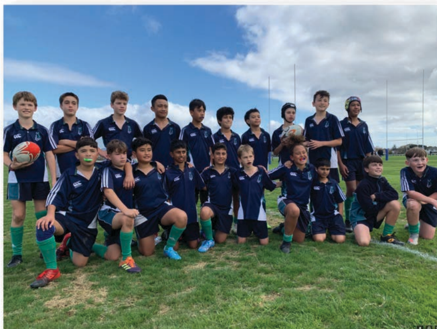
Boys under 55kg Rugby

On Tuesday the Under 55KG Rugby team suited up and went out to the Western Zone Tournament at Avondale Racecourse. The sun was shining and the paddock was soft. The boys had a tough day on the pitch and weren't able to catch a win, but they never gave up and gave it their best at every game right up to the final whistle. There were some magnificent tries and a couple of great runs and the boys should be very proud of what they achieved. Some had never played Rugby before. Massive thank you to our two parent coaches who built a committed and engaged team in a short period of time.