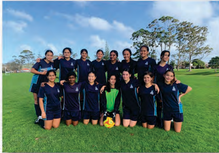
Girls football 2022

On Wednesday 1st of June the BHB Girls Football teams competed at the Western Zone Football Tournament. We took a Year 7 and a Year 8 team. Our Year 8 team kicked off well winning both games considerably. The girls' goal of returning to the Inter-zone Tournament again was firmly set in their minds. The third game ended in a draw against Green Bay and a loss in the last game against Glen Eden put us in third place. Our Year 7 teams struggled to make their mark and unfortunately didn't come away with a win. Both teams played really hard and gave it everything they had. Thank you to the parents that came out to support the teams.