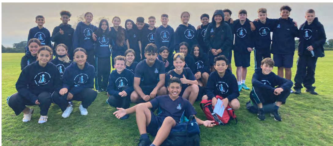
Sports Camp 1 2022