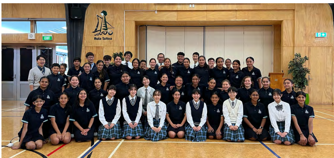
The Kapa Haka group with our Japanese visitors from Futaba Future Jr. High School