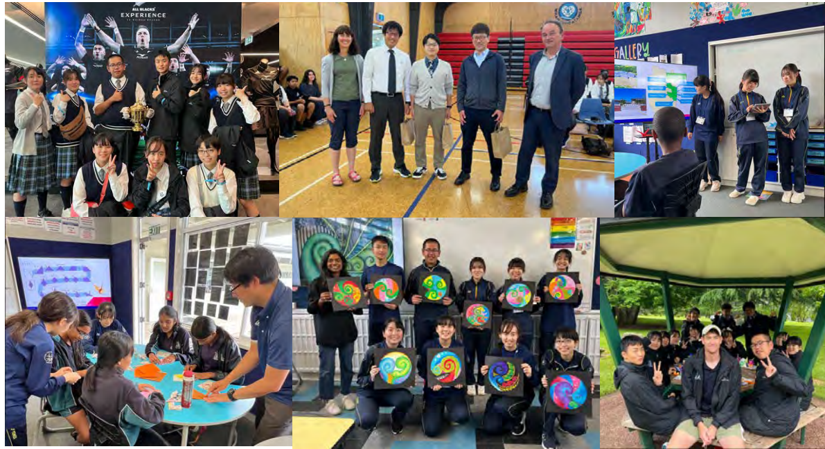
A snippet of the fun things our Japanese visitors got up to