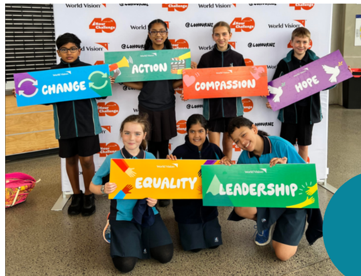
Blockhouse Bay Primary and Blockhouse Bay Intermediate students

On the 1st of May our four 40hr Famine Leaders attend the World Vision Conference with other schools from across Auckland. We learnt about the water shortages and droughts around the world, and the conditions that many young children have to live, and unfortunately die in. Discussing how we, as leaders, can spread awareness and help raise money towards bringing fresh water to communities in need. Although these realities were hard to hear, we were left feeling inspired and hopeful that by starting our own campaigns we can motivate others to get involved in the 40hr Famine Event coming up in June.