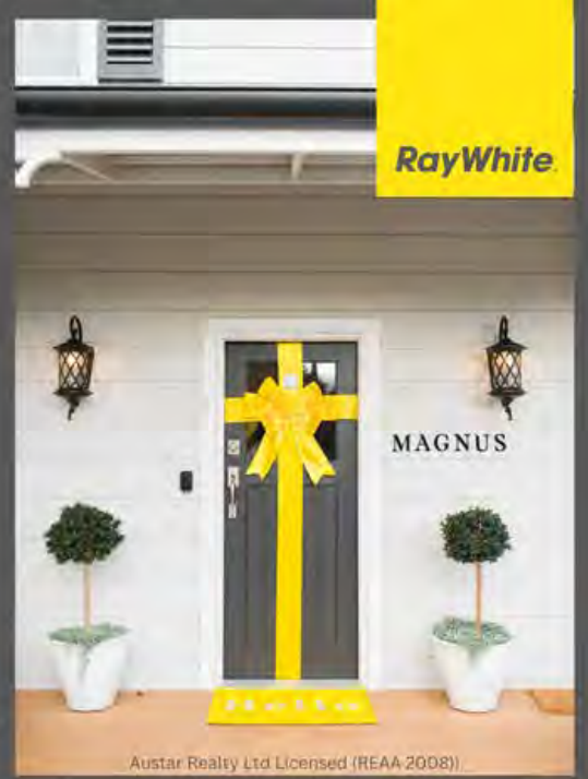
Austar Realty Ltd Licensed (REAA 2008)