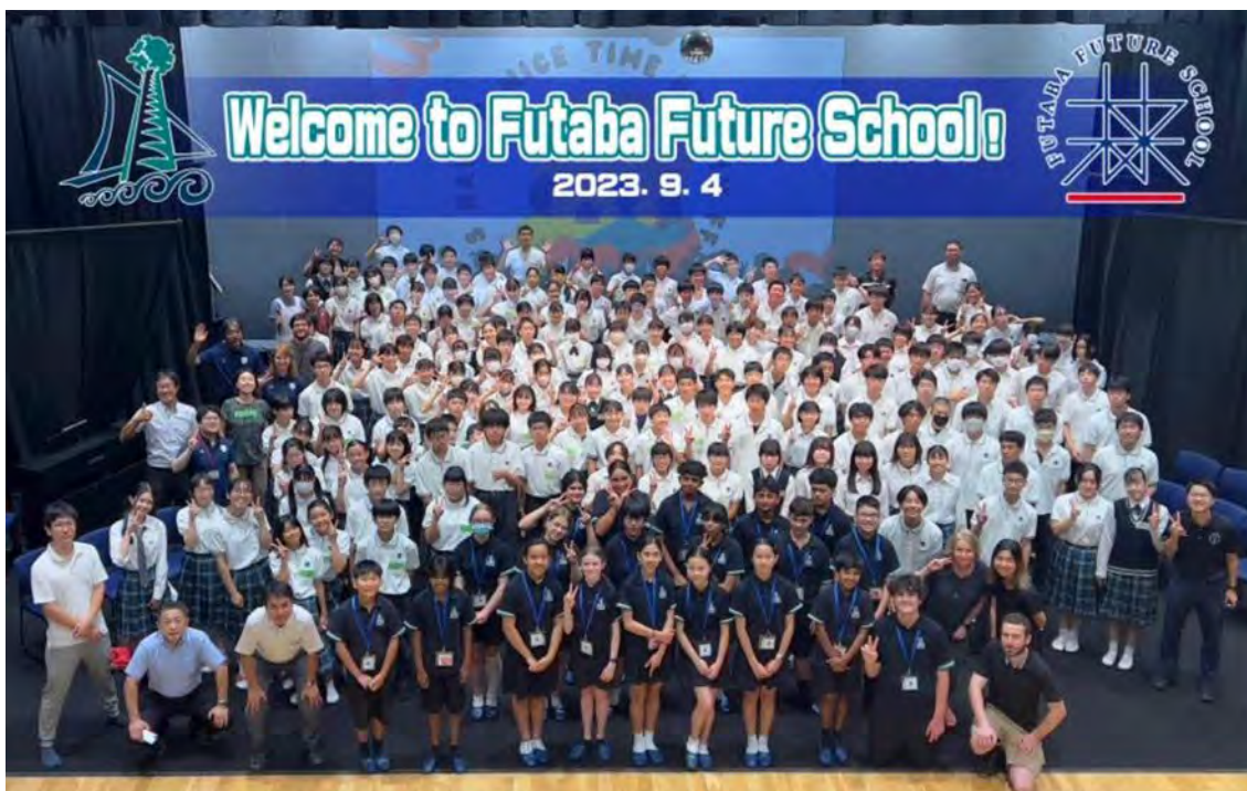
BBI Students and staff at Futaba Future School