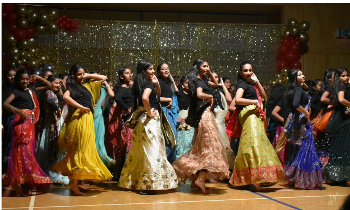
The Bollywood dance group tearing up the stage on Talent Show finals night!