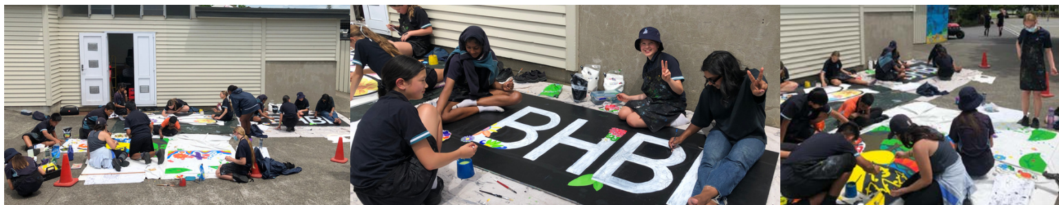
Mural making magic in progress...