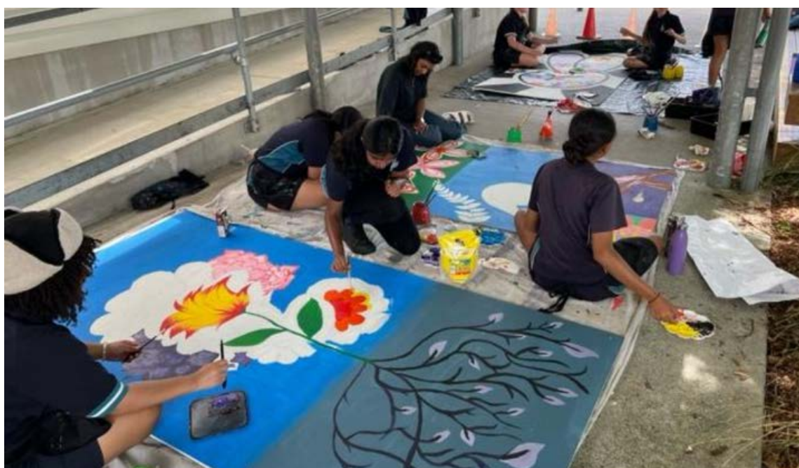
Artists at work- the future is bright!